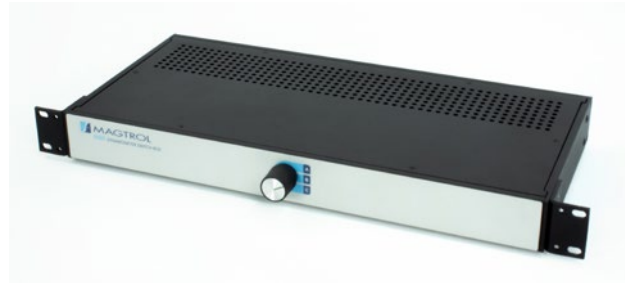
Fig.1 : 5502 Manual Dynamometer Switch Box

Magtrol Models 5502 and 5503 are manually-operated switch boxes that permit the connection of up to three Magtrol Dynamometers to a single Dynamometer Controller. Use of the switch boxes facilitates quick and easy interfacing to multiple dynamometers without the need to disconnect and reconnect the brake and control cables. For Magtrol WB Eddy-current or PB Powder Brake Dynamometers, BOTH a 5502 AND a 5503 Switch Box are necessary. Magtrol HD or ED Hysteresis Dynamometers only require the 5502.