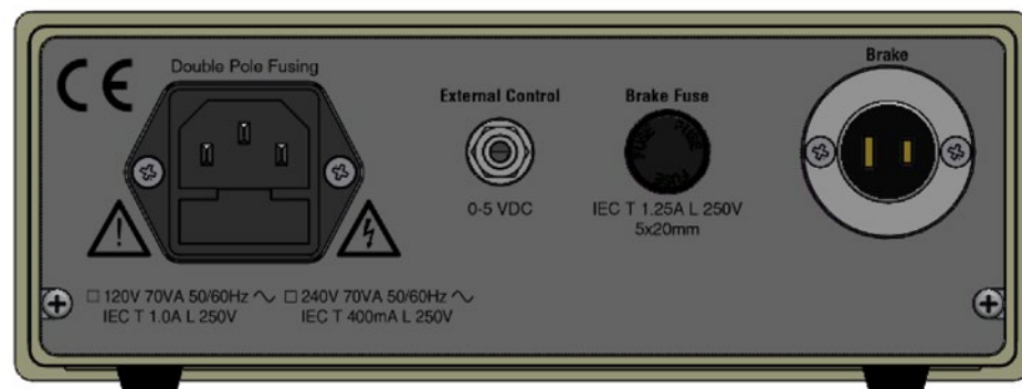
Fig. 1-2 5211 Rear Panel